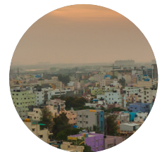
Country Headquarters, Bangalore, India