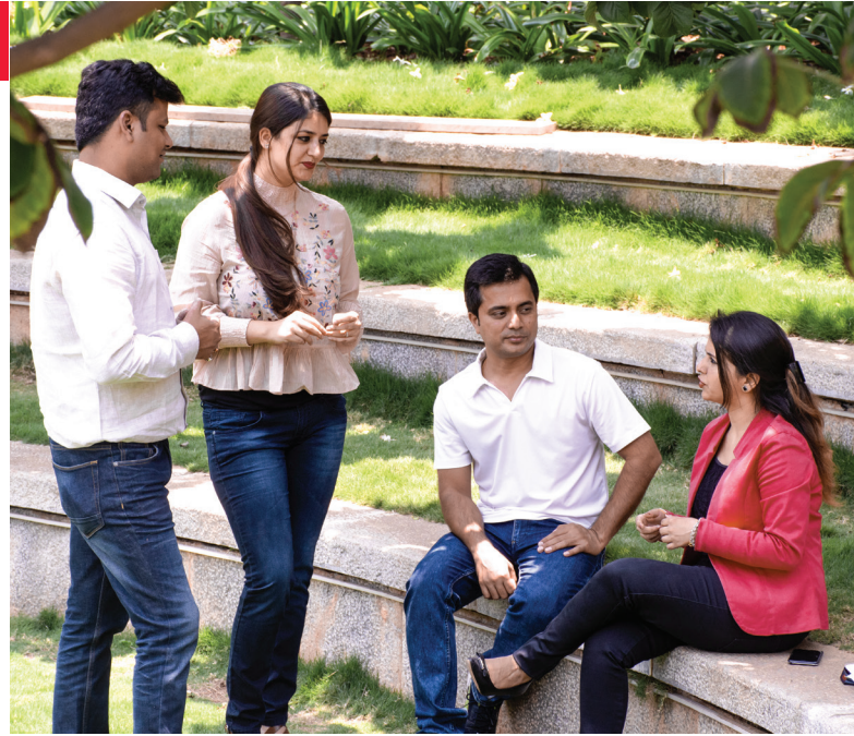
Co-creating solutions for an inclusive and equitable carbon-neutral future

India is an important location for Hitachi Energy and home to one of its Engineering Centers. Building on its long and rich heritage in the country, the Company continues to pioneer technologies that integrate renewable energy into the world's power grids and accelerate the electrification of transportation, industries and buildings sectors. Hitachi Energy India Ltd. is listed on both stock exchanges in India.